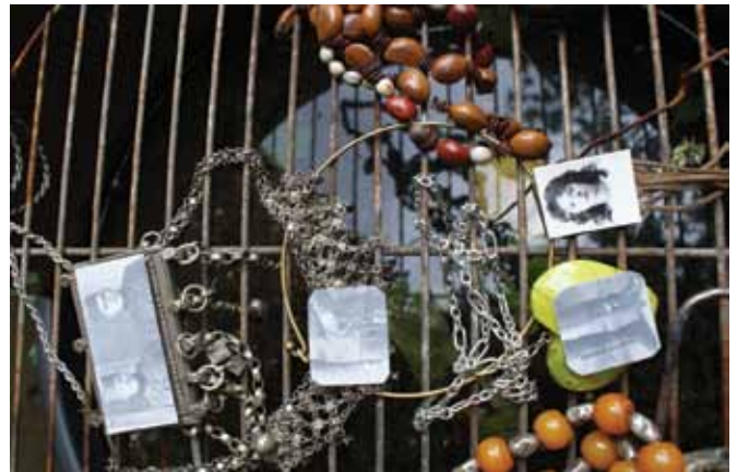
50 Rooms , image by Natasha Davis

experiencing anew personal states of imbalance and displacement, an audience member, who may or may not have experienced such a condition themselves, can approximate the pain of the other'. But in your work you go a bit further with this conceptual invitation, you open up a hospitable space by inviting interested non-performers/audience to join your show and 'share autobiography'. What is 'shared autobiography'?