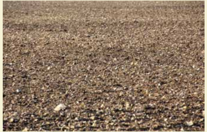
Mapping 2, 2016.