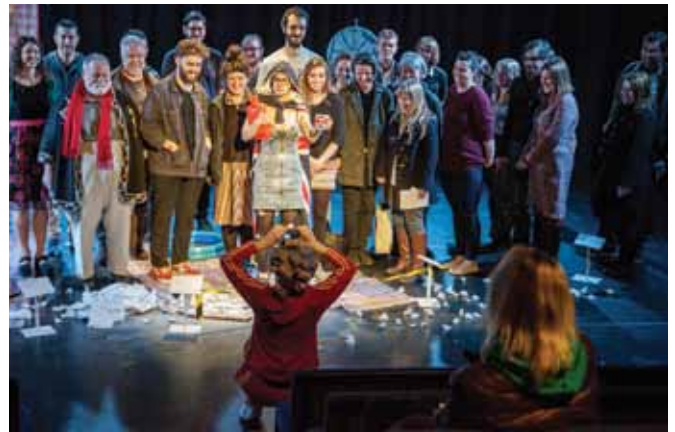
There There, Eastern European for Dummies, performance.

What kind of strategies are you using in order to address the current debates?