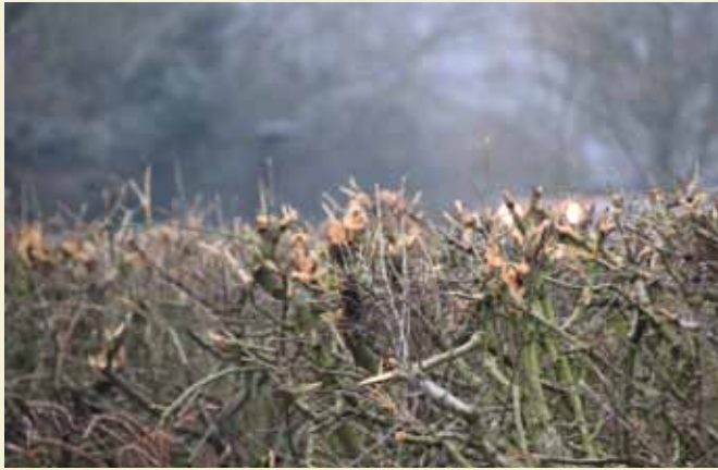
Mapping 1, 2016.