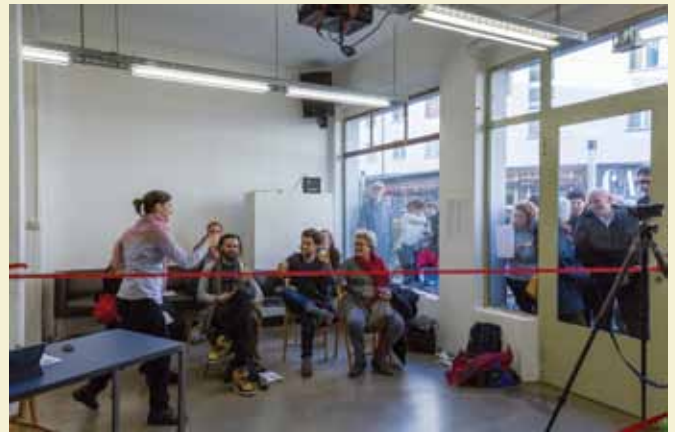
Verica Kovacevska, The Boat is Full , 2016.