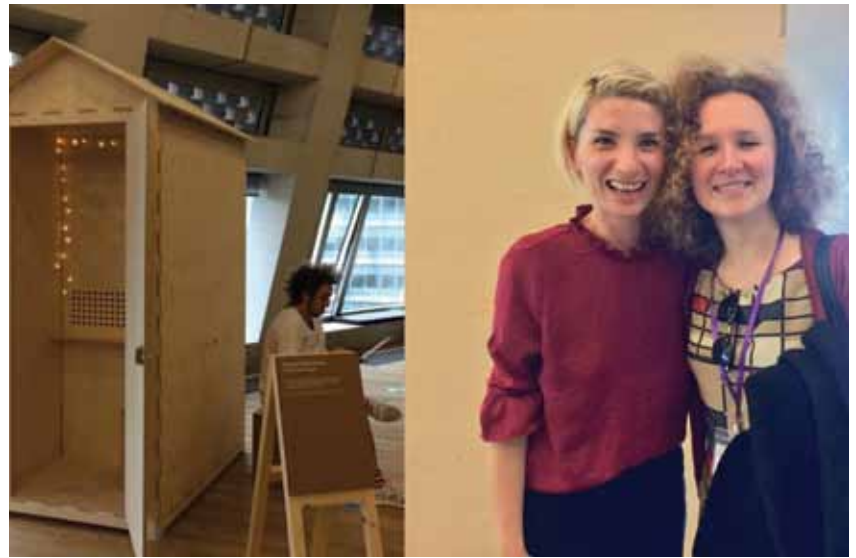
Waiting for a New Life, Photography project with Yezidi refugees using disposable cameras, Batman, 2015