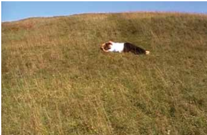
Selma Selma, Anew, performance documentation