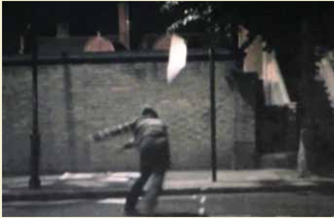
Give em Hell by Nada Prlja, 2008, Single screen video 4 min, DVD-Pal, colour, loop; Music: Ludwig van Beethoven, Symphony Nr. 9 d-moll , op. 125.