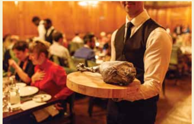
Pluto's Kitchen by Işıl Eğrikavuk, commissioned by Open Space Contemporary and Block Universe at the Ned, London, 2017.