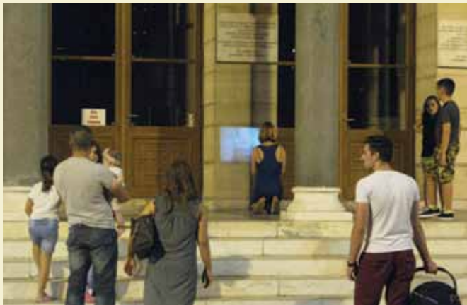
Vijécnica, Sarajevo Library, Sarajevo, Bosnia