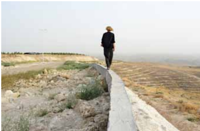
Mapping the Borders of a Turkish Institution, Performance Walk for Camera, Batman, 2014