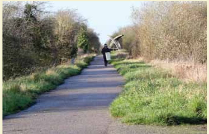
Still from 'Keep to a well-trodden path', 2017.