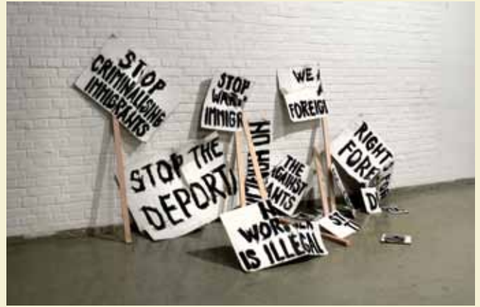
Stop the War Against Immigrants I by Nada Prlja, 2008 7 broken protest banners; acrylic white and black paint on board, wooden sticks.

Nada Prlja , The video material used to create this documentary video is recorded by a hidden video camera. During the course of several days in the summer of 2008, the artist positioned protest banners with pro-immigration slogans on the streets of London and secretly recorded the unfolding scene with a camera from the opposite side of the street.