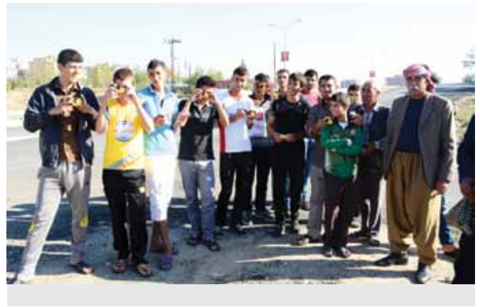
Waiting for a New Life, Photography project with Yezidi refugees using disposable cameras, Batman, 2015

wanted to take selfies with me, and then invited me to have lunch with them in their cabin. It's risky to be too open about political views there, especially if you have a position of authority, and so I think the playfulness of the action was quite appropriate, but I think that to do this as someone who actually is part of that community, or actually Kurdish would be perhaps more significant. After speaking with the professor who invited me and some of his friends, some said that they would have liked to join me on the walk or do something similar, would never ever be able to do that because of the possible repercussions. Actually, he is now under investigation after the military coup, as many academics in Turkey now are, but I have not heard from him for a while so I am not sure how he is.