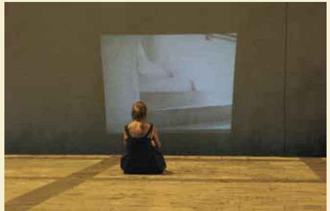
National Art Gallery, Tirana, Albania

Using a mobile phone projector sleeve kept in my purse, and kept close to my body, I projected a 4 minute looped film of a woman walking, itself a displaced 'pilgrimage'. 20 repeat presses, 20 small acts of memory disruption. The aesthetics of repetition and the pulse of the city.