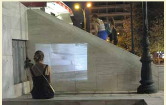
Syntagma Square, Athens, Greece

About the artist: Nicole Zaaroura is an artist working with photography, performance, sound, moving image and installation, to explore through documented performative acts, notions of intimacy and distance, the meditative and discordant, in both public and private locations. It is a practice rooted in encounter, and an investigation into the brutal tenderness within journeys.