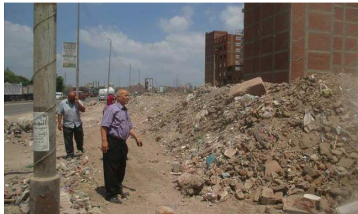
Fig. (1): 300 Tons of C&D Waste Dumped on Main Roads of Mansoura City