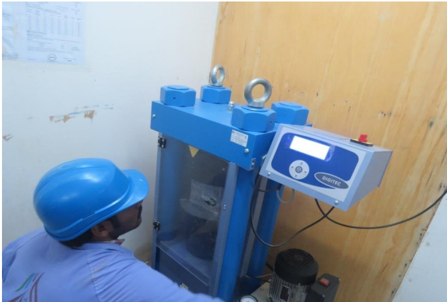
Figure 4: Compaction Test of Different Cube Trough Compaction Testing Machine (BS 1881-116:1983) [19].

After properly curing the prepared concrete cubes for seven and 28 days in the water tank, were then tested for compressive strength through a compression testing machine as shown in figure 4 (BS 1881-116:1983) [19]. The average value of compressive strength was recorded. It was noticed from the results that there is steep growth in compressive strength with the addition of ceramic powder. This is possibly because of the silica content present in the ceramic powder. Beyond 30% replacement, there is a decrease in strength. This is possibly because of less amount of cement in the mix. Based on this statement it can be concluded that a 30% replacement is optimum. The results are presented in Figure 5. It can be observed from the figure 5, that the compressive strength of concrete having ceramic waste powder of up to 40% reduced from 36.95 MPa to 25.9 MPa, which is, however, meeting the minimum requirement of the compressive strength for this grade of concrete. This, however, indicates that increasing the ceramic waste from more than 30% will result in a reduction in compressive strength. Although it is observed that the variation of ceramic waste can change the strength of concrete, however, the chemical composition of the ceramic-waste can play a significant role. A ceramic waste with a different chemical composition will defiantly give a different strength of concrete.