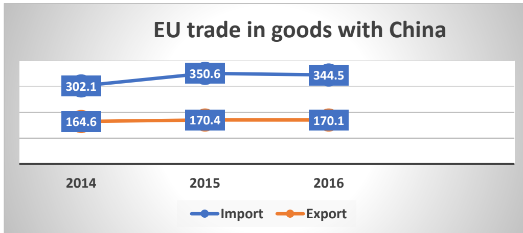
Figure 2. EU trade in goods between 2014 and 2017 in billion EUR. Data taken from [23]

Figure 2 shows the growth in goods trade between EU and China which is annually increasing on average by 4.2%. The online shopping market in China in 2014 reached 2.8 trillion CNY (China Yuan) and has an annual growth rate of 48.7% [4]. Rapidly growing online market in Asia-Pacific region overtake USA, reaching $500 billion [24]. Expanding the online retail market increases the share of express delivery services whilst the air cargo market will grow by 7% year on year [25]. One third of high value goods transported between China and Europe is transported by air [26]. In the future the importance of express delivery services will only increase as world economy becomes more integrated and express delivery services minimize the inventory costs.