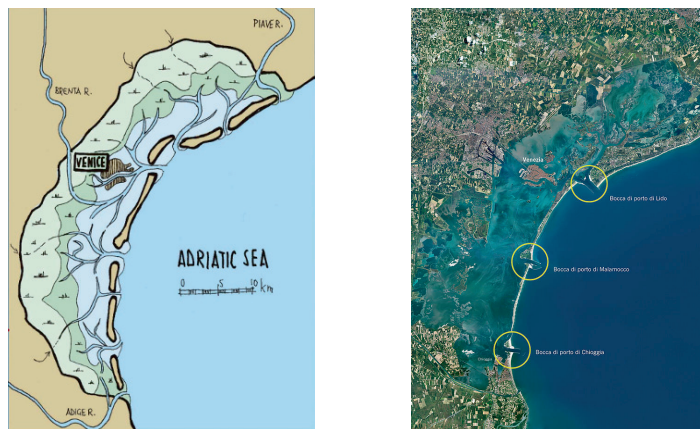
Fig. 1. The Venice lagoon in the 15 th century (left) and today (right).

This paper evaluates the existing and proposed mitigation options that are carried out to reduce the multi-hazard vulnerability of the Venice lagoon and the surrounding area. It carries out a review to establish the objectives, responsibilities, instruments and measures that were employed for carrying out these safeguarding activities. The paper examines the impact of the mobile tidal barrier system (MOSE, started in 1987 and to be completed in 2014), coastal reinforcement measures, the raising of quaysides, inner canal dredging and the paving and other infrastructure improvements to mitigate the impact from flooding which are designed to protect Venice and the lagoon. The impact of early forecasting and warning systems, improved communications to all stakeholders and service providers to improve rapid responses is also discussed.