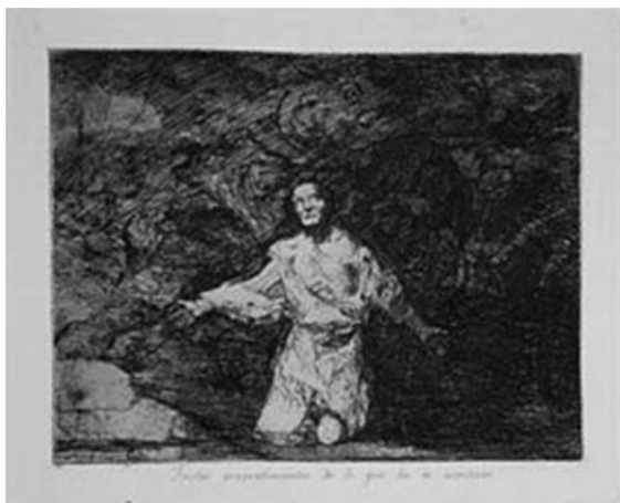
Figure 6. Francisco Goya, Los Desastres de la Guerra , Plate 1, 'Dire Forebodings of What is to Come', 1810–20.

Starting from Goya's prints, the Chapmans' works take on their own life, and a further series of references. From the marking and the effacement of given images – like the graffiti of a swastika sign on Goya's Plate 39, 'What a Feat! With Dead Men!' – to their reworking of other Disasters with additions that the Chapmans call 'improvements', to the construction of sculptural compositions that reproduce Goya's images ( Great Deeds Against the Dead , 1994) or reinterpret them in scenes of nauseating decomposition ( Sex I , 2003), in different ways the Chapmans take Goya's works out of the timeless and universal realm of art, and reactivate them (in this sense they are 'improvements'), not only by bringing selected elements and faces (and therefore identities) to the fore of the images and to the