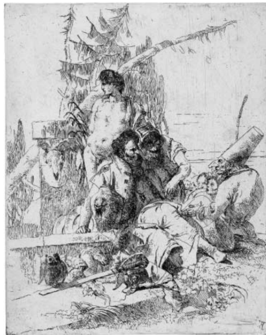
Figure 2. Giovanni Battista Tiepolo, 'Pulcinella gives counsel', Scherzi di Fantasia , c. 1743–57. (source: Art Gallery of South Australia; Wikimedia commons - http://commons.wikimedia.org/wiki/File:Giambattista_Tiepolo_-_Punchinello_gives_counsel_-_from_the_series_%27Scherzi_di_Fantasia%27_-_Google_Art_Project.jpg , accessed 02/02/11).

Both timeless and simultaneous 7 these beings and objects do not allow chronological unfoldings: there is no linear narrative here, but a circular recombination that refuses a resolution. Like the rest, the remnants of ancient sacred architectures included in these jumbles are dissolved and re-combinable – available to enact a new (or another) kind of proximity, in a space that blurs the distinction of form and matter. The vast brightness of these images – that excess of light that blinds any understanding – surrounds the groups of the Scherzi , ephemeral clumps of matter, gathered in an unlimited space that they cannot control. That which cannot be seen in the blinding light (death? divinity? the infinite? an incomprehensible idea of space?) is that which is not