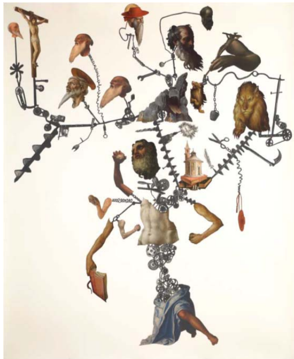
Figure 8. Michael Landy, Saints Alive. Penitence Machine (Saint Jerome), 2012 (source: the Artist; courtesy of the Artist and Thomas Dane Gallery, London).

The key to an understanding of these torture-iterating machines lies in their preparatory work: the drawings of the parts, the cut up pieces of the paintings' images, and their collages, which are in turn redrawn in a self-feeding process. More than a documentation of the working process, these drawings and collages are the long lasting pieces of this composite work. In them Landy studies and redraws a selection of paintings from the National Gallery collection, choosing as he redraws the key elements of each painting, and of each saint in each painting. At first architectural and natural backgrounds are removed, as well as the ground, and the characters float in the black ink of the drawing, as if on a contemporary theatre stage. Liberated from all