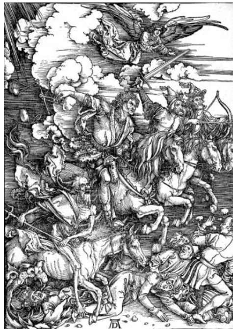
Figure 1. Albrecht Dürer, The Revelation of St John: The Four Riders of the Apocalypse, 1497–98. (source: Staatliche Kunsthalle, Karlsruhe; Wikimedia commons - http://commons.wikimedia.org/wiki/Image:Durer_Revelation_Four_Riders.jpg , accessed 02/02/11).

At the level of the single image, Dürer condenses the biblical narration of John's Apocalypse in a synoptic narrative. For