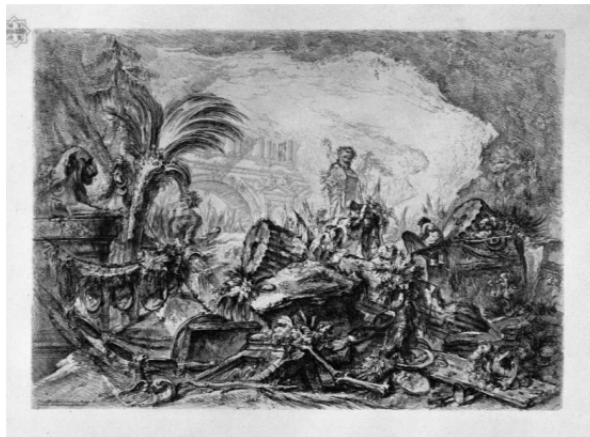
Figure 3. Giovanni Battista Piranesi, Capricci or Grotteschi , 1744–47; Opere Varie , 1750, second edition.

Already invaded, contaminated and occupied by other bodies, this is what remains of ancient architectures. The ensembles of Piranesi's Capricci , congested with vestiges of the past and heterogeneous records of their inevitable transformation, prepare the ground for a freedom of architectural and spatial experimentation. 11 Rather than the documentation of the ruins of the past, here we have the reinvention of a fantastic antiquity through the reuse of its fragments. Rather than the fragment as a trace of the past, here we have the present of the fragment and the fragment in the present, amnesiac and available in real time, so that ‘[w]e can only see these things as they are’ (Argan), and their representation – combining of necessity documentation and imagination, performs a re-signification.