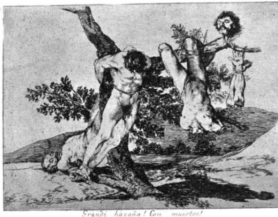
Figure 5. Francisco Goya, Los Desastres de la Guerra , Plate 39, 'Great deeds! Against the dead!', 1810–20.

etched line to obliterate time and space. Goya's aquatint creates fields of textures that layer in flattened depth around and through the groups of bodies, and 'the drama and intensity of the scenes become perfectly integrated with the expressive possibilities of his technical means.' 19 Space here is only in the action of the bodies; the rest of the image remains an opaque depthless field, apparently even and neutral, but in fact concealing further disasters. Each of the episodes, disconnected from the others, becomes an absolute island of universal horror, threatened to disappear into the sameness of indifference. 20