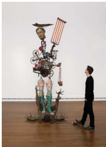
Figure 7. Michael Landy, Saints Alive. Multi-Saint , 2013 (source: the Artist; courtesy of the Artist and Thomas Dane Gallery, London).

The result of Landy's work on the paintings of the saint martyrs continues some of the themes of his previous works: the catalogue and the destruction, the ephemeral and the violent. For the National Gallery he produced a series of larger than life Tinguely-esque interactive kinetic sculptures that combine fragments of the saints and their attributes drawn from many different paintings in the collection. 24 These machines perpetuate with their repetitive motion the moment of violence, torture or attack that has elevated the victim to sanctity: Apollonia plucks her eyes; Thomas points his finger at Christ's chest so violently that his headless torso swings like a punching ball; Catherine's gigantic wheel can be spun by gallery visitors; Francis dispenses t-shirts like an amusement park's 'fish-the-plush-toy' attraction; Jerome beats his chest with a stone to self-destruction, in order to keep at bay his impure thoughts. 25 Most interesting of them all is Multi-Saint (2013), a hybrid construction made of a pair of Satan-